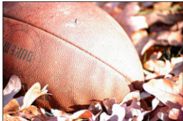
"Childhood Playground" by Chris Brown is licensed under CC BY-NC-ND 2.0

That was the day I heard my boys laugh two yards over, yelling touch down!